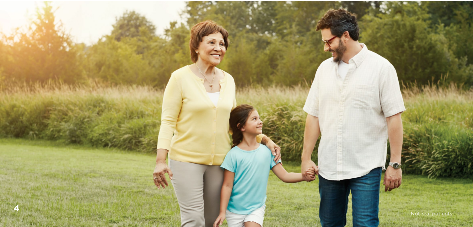
Not real patients.