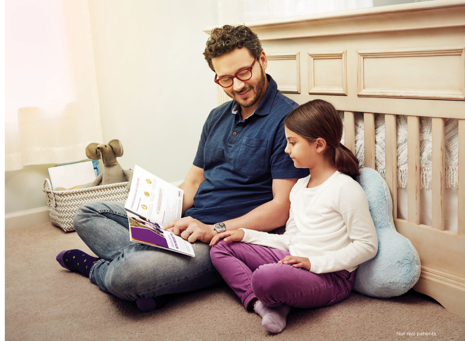
Not real patients.

2 Information and discuss with your doctor.